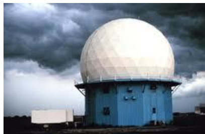
fig 2. Example of weather monitoring by radar

Meteorologists use radar to monitor precipitation. It has become the primary tool for short-term weather forecasting and watching for severe weather such as thunderstorms, tornadoes, winter storms, precipitation