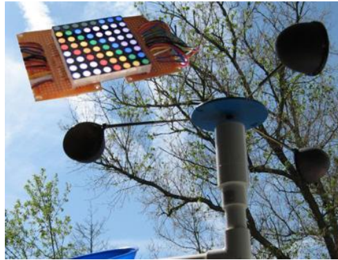
fig 3 example of weather monitoring by microcontroller

and thermometers. According to Windmill, computers are used to display, analyze, record and also predict weather patterns. Computers using weather monitoring software and devices are also often linked to control mechanisms, so that, for instance, when the temperature reaches a minimum level, the computer switches on the heating in a house.