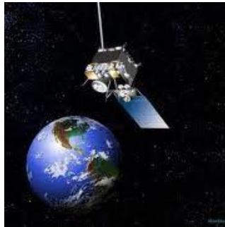
Fig 1. Example of weather monitoring by satellite

The first weather satellite to be considered a success was TIROS-1, launched by NASA on April 1, 1960. TIROS operated for 78 days and proved to be much more successful than Vanguard 2. TIROS paved the way for the Nimbus program, whose technology and findings are the heritage of most of the Earth-observing satellites NASA and NOAA have launched since then.